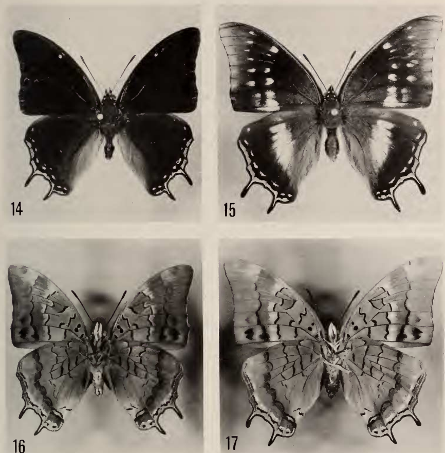
FIGS. 14-17. Imagines of C. marieps . 14, ♂ upperside; 15, ♀ upperside; 16, ♂ underside; 17, ♀ underside.